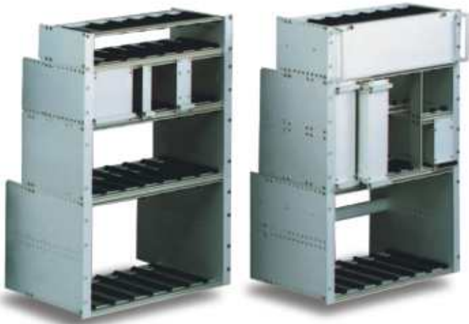
Some of the different styles of Card Frames available in the Series 20 range

The Series 20 family of Card Frames from APW President has several new features that enhance the level of precision and adaptability. The side panels have half-shears and locating holes at 15mm depth intervals for accurate positioning of the width extrusions. This design not only increases precision, but also provides considerable flexibility to the user. Additional clearance is provided between the side panels and the solder-side of the first PCB. Front and rear extrusions are printed with location numbers.