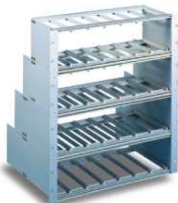
Heights from 2U to 6U & beyond

Heights : 2U, 3U, 4U, 5U & 6U Widths : 21T, 42T, 63T, 81T & 84T Depths : 180, 240, 300 & 360mm