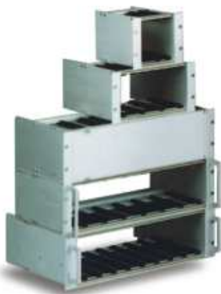
Widths from 21T to 84T

Card Frames form the basic building blocks of instrumentation system. Most application requirements can be met with the choice of heights, widths and depths. Customized solutions can be developed to fulfil specific customer needs.