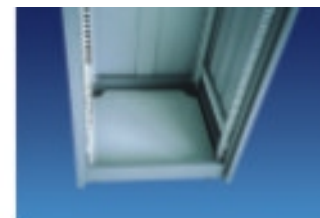
View of Bottom Panel