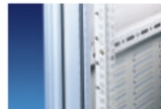
Height 'U' numbering