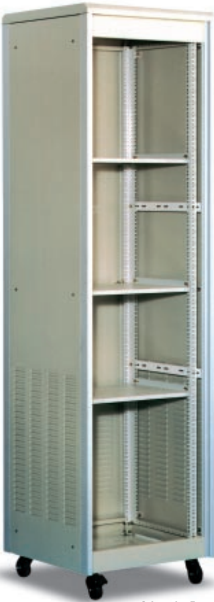
Cyberack - Front view

The load capacity remains at 350 kgs. The four corner vertical profiles are fixed rigidly to welded steel end frames so as to provide an extremely stable frame structure. The doors have concealed hinges and close within the aluminium profiles so as to provide sealing against dust and protection against transportation damage.