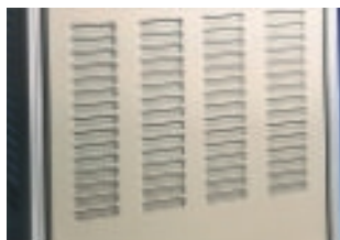
Louvered Side Panels