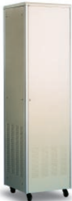
Rear view - with optional steel door