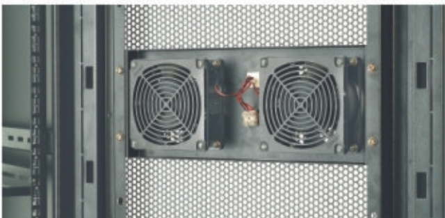
19" Fan Tray