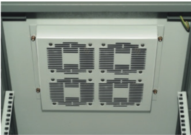
Fan Housing Unit