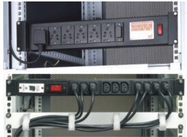
AC Mains Distribution Box