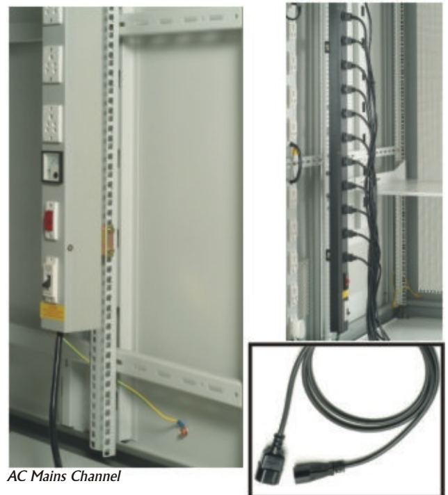
AC Mains Channel