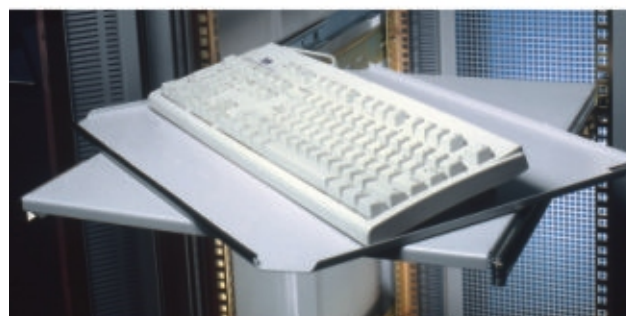
Rotary Keyboard Tray

* For Cyberacks of 600mmD please specify 86-1888 instead of 86-1771