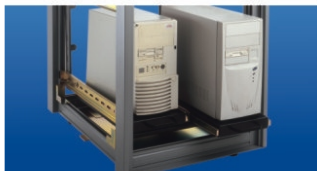
Dual Server Tray