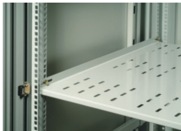
Heavy Duty Shelf